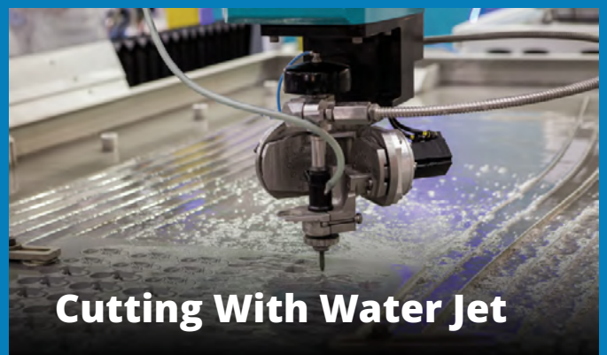
Cutting With Water Jet