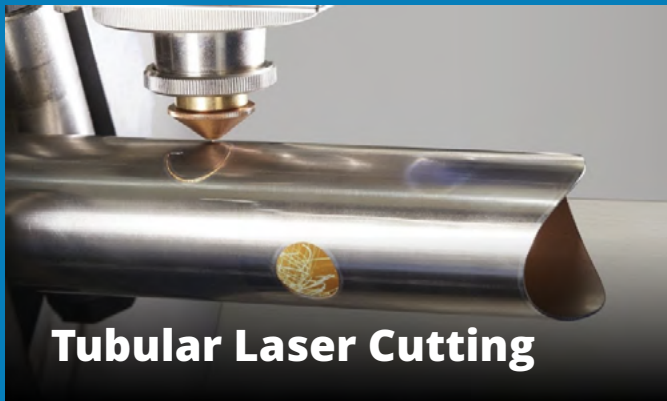
Tubular Laser Cutting